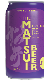
BEER THE MATSUI BEER HIGH CLASS