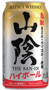
HIGHBALL THE SAN-IN