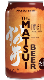
BEER THE MATSUI BEER AGED