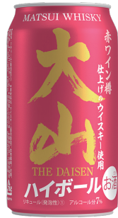
HIGHBALL THE DAISEN