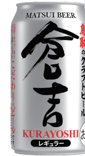
BEER KURAYOSHI REGULAR