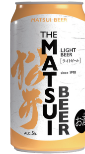
BEER THE MATSUI BEER LIGHT